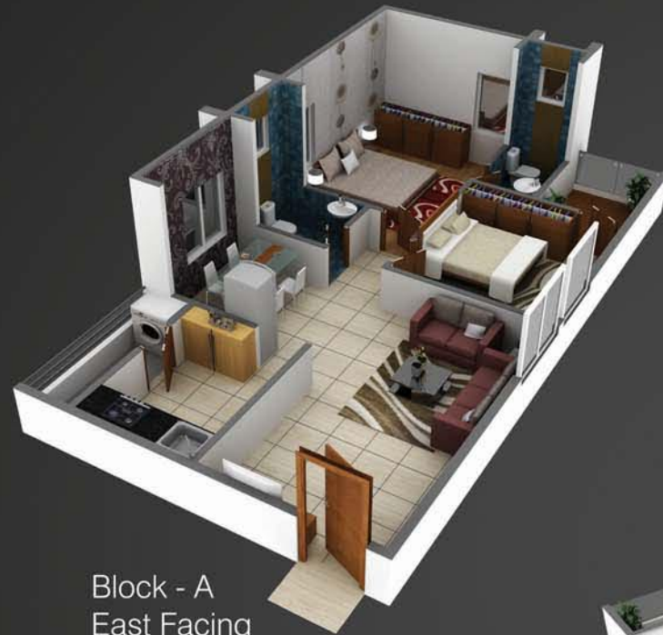
Block - A East Facing 1025 sft