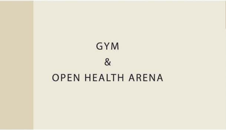
GYM & OPEN HEALTH ARENA