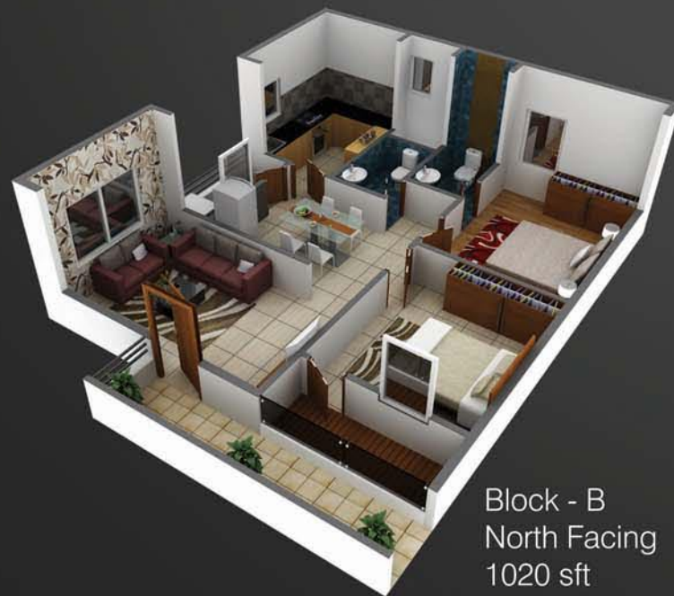
Block - B North Facing 1020 sft