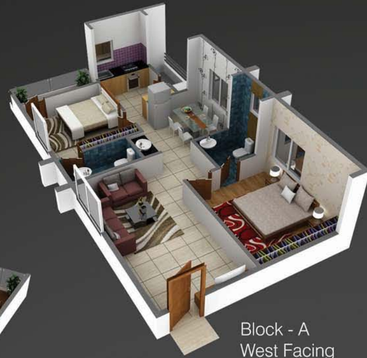
Block - A West Facing 1045 sft