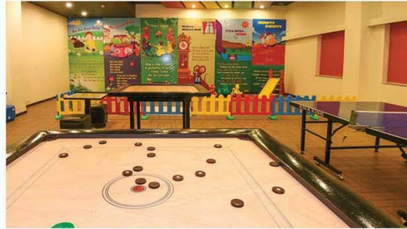
CHILDREN'S PLAY ZONE ( TABLE TENNIS, CARROMS, CHESS)