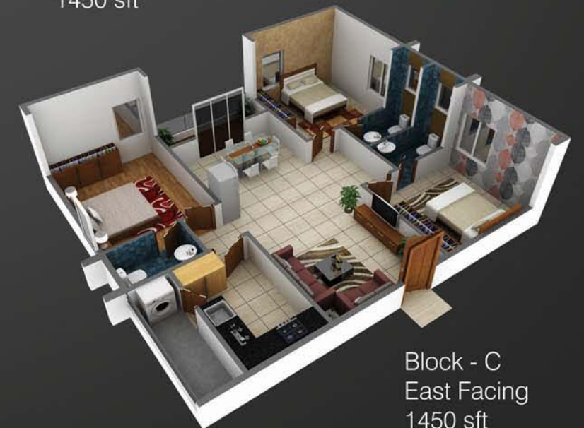
Block - C East Facing 1450 sft