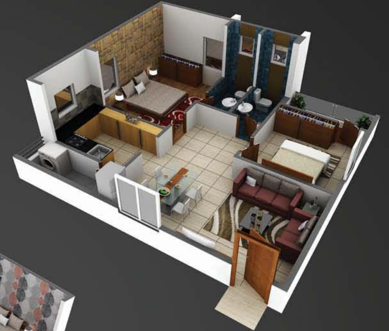
Block - B East Facing 1020 sft