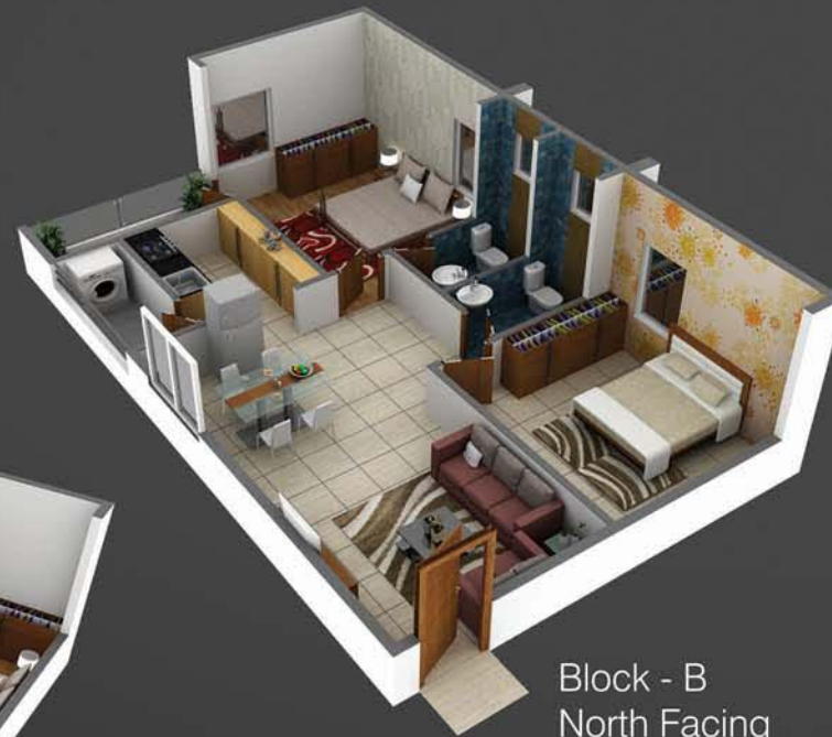
Block - B North Facing 1040 Sft