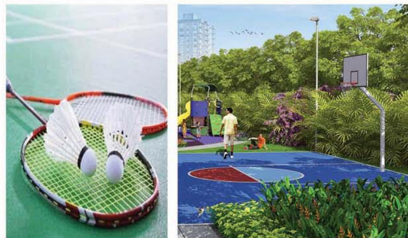
SHUTTLE COURT & MINI BASKETBALL COURT