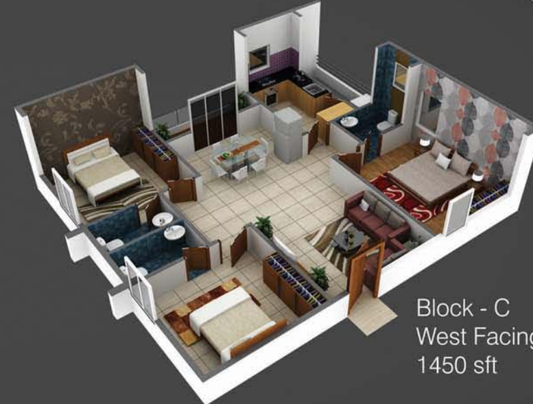
Block - C West Facing 1450 sft